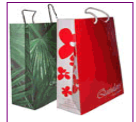
6 - Order materials on an as-needed basis.

Waste exchanges reduce disposal costs and quantities, reduce the demand for natural resources and increase the value of waste.