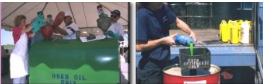
13 - Chemical waste should be disposed of according to the manufacturer's directions and State and local requirements.

A good plan should be kept where it can be easily viewed by employees near mixing and storage areas. Besides detailed instructions for staff, a spill response plan includes a diagram showing the location of all chemicals, floor drains, exits, fire extinguishers, and spill response supplies.