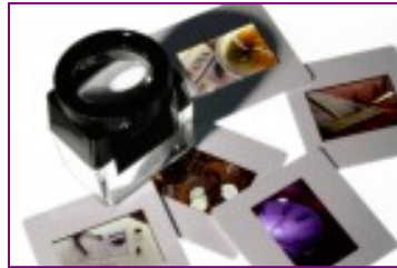
1 - Photo finishing.

Examples of places where small quantity chemical use occurs.