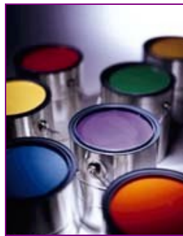
3 - Paint processing.